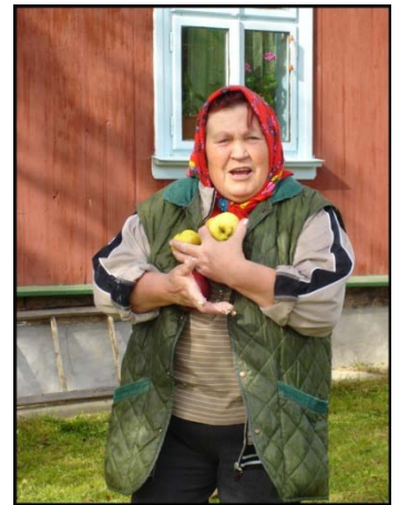
Village woman offers apples