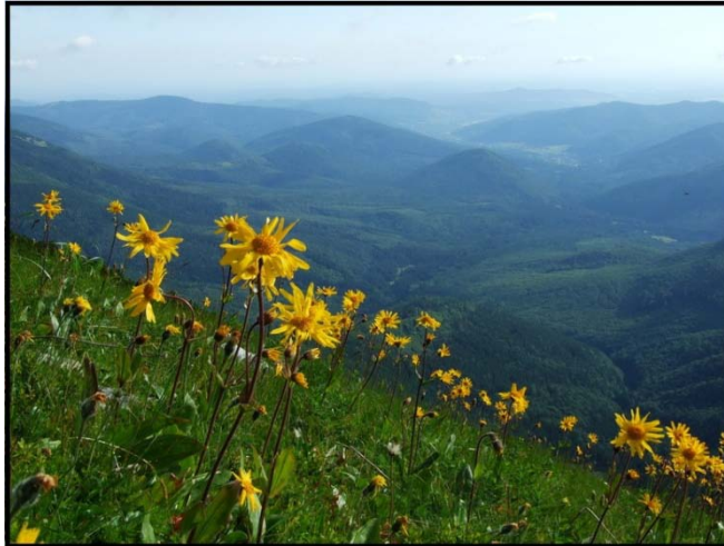
Unique flora of the Carpathians